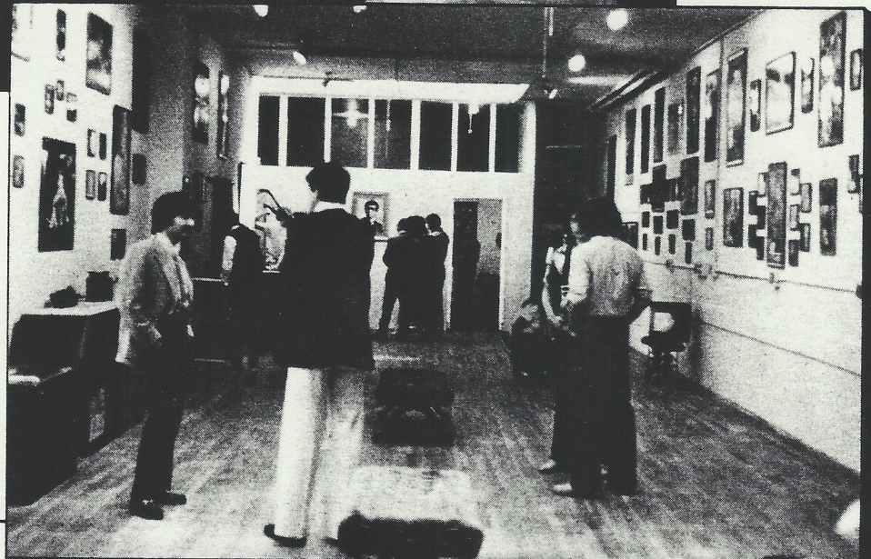
Scenes and pictures adorn the walls chronicling Bruce's career.