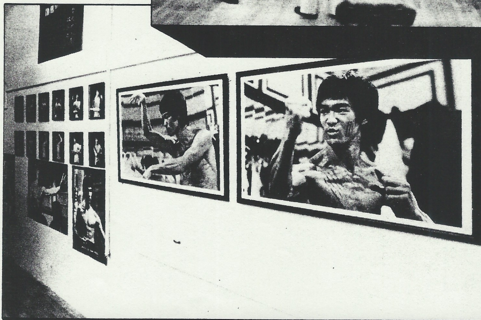
Movie fans will find each of his films well represented on the museum's walls.